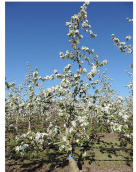
Crisp red in bloom